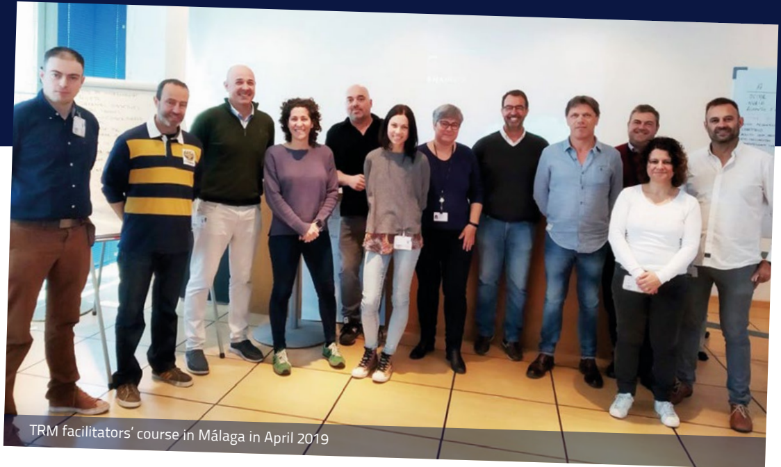
TRM facilitators' course in Málaga in April 2019