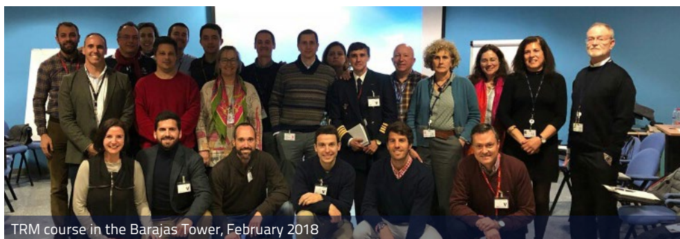
TRM course in the Barajas Tower, February 2018

TRM sessions eschew traditional teaching concepts (class attendance) to focus on helping attendees to learn for themselves (participation) and to be involved in its implementation with a critical and open mind, both in oneself and in others.